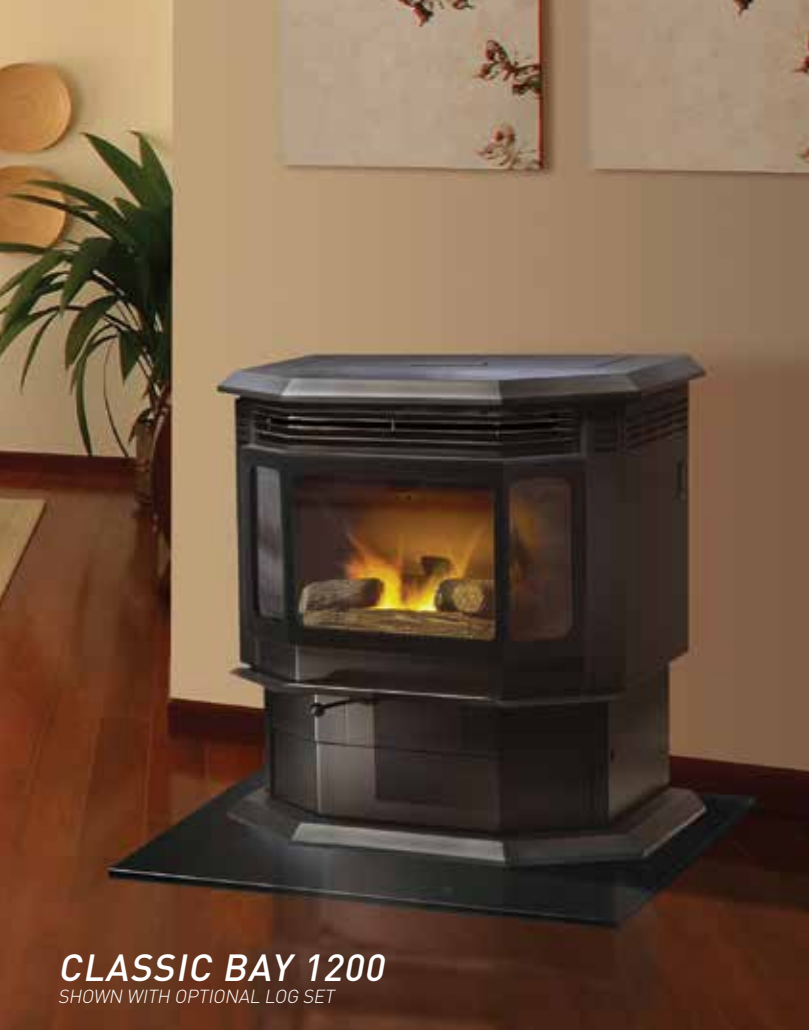
CLASSIC BAY 1200 SHOWN WITH OPTIONAL LOG SET