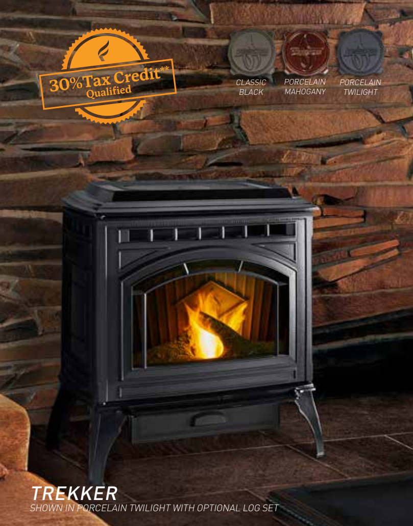
TREKKER SHOWN IN PORCELAIN TWILIGHT WITH OPTIONAL LOG SET