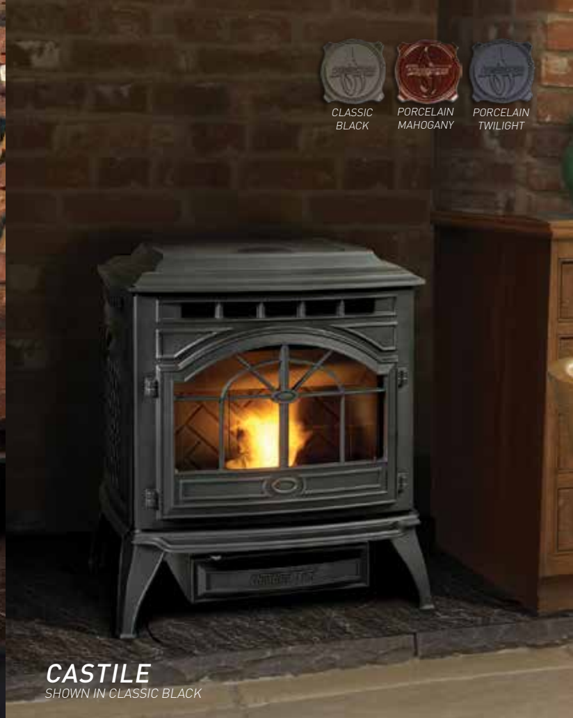
CASTILE SHOWN IN CLASSIC BLACK