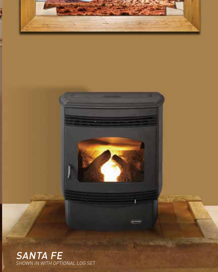
SANTA FE SHOWN IN WITH OPTIONAL LOG SET