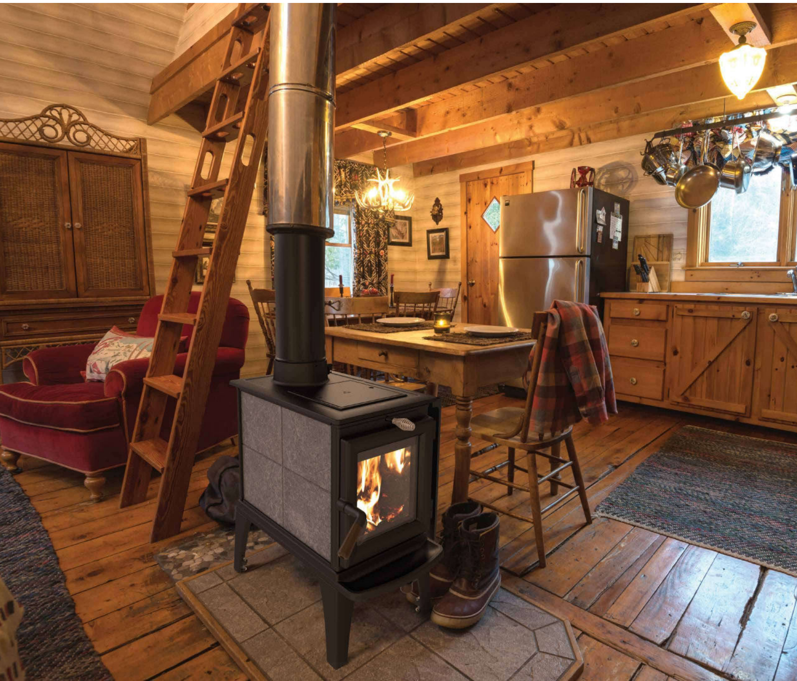
The Lincoln 8060 Wood Burning Stove