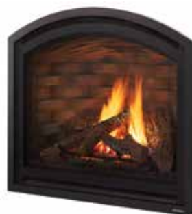
FIRESCREEN available in black, graphite and new bronze