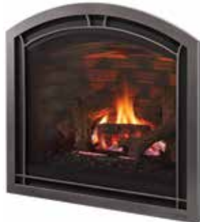
IRON AGE available in black, graphite and new bronze