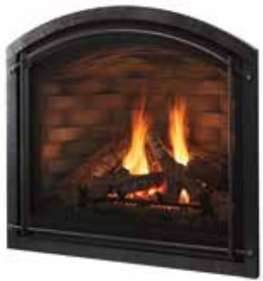
CHATEAU FORGE available in hand-crafted hammered steel

Each front ships with ClearVue® mesh, a virtually invisible safety screen.