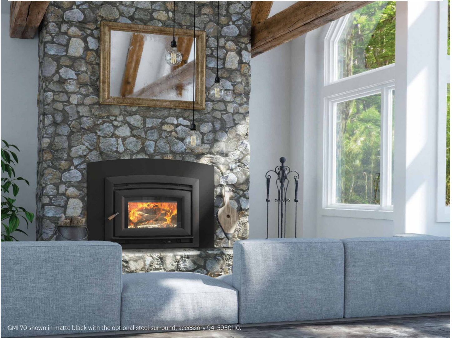
GMI 70 shown in matte black with the optional steel surround, accessory 94-5950110.