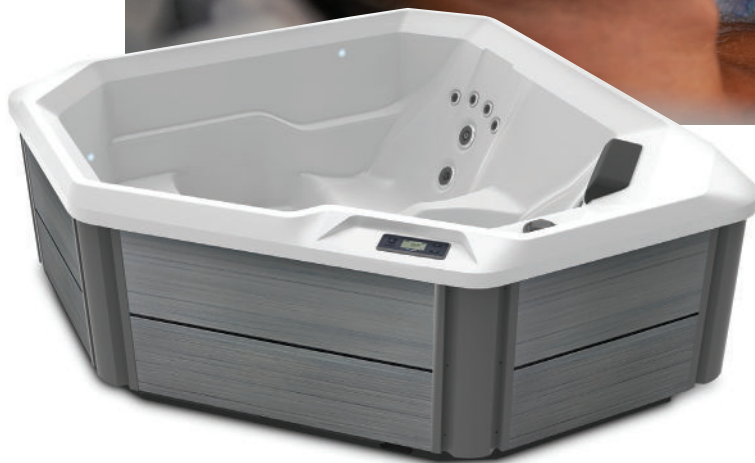
Shown with Alpine White Shell and Storm Cabinet.

People Seating Jets Voltage 2 Seats Open 11 Jets 115 V or 230 V