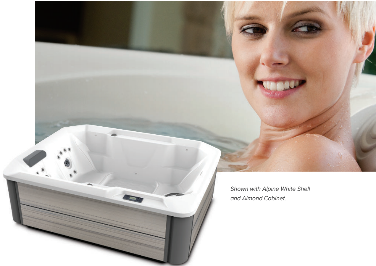
Shown with Alpine White Shell and Almond Cabinet.

People Seating Jets Voltage 3 Seats Lounge 20 Jets 115 V or 230 V