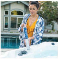
Frog® @ease® In-Line Cartridge Ready