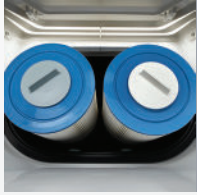
Dual Action Filtration SilentFlo Circulation