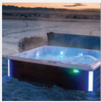
FiberCor® High-Density Insulation