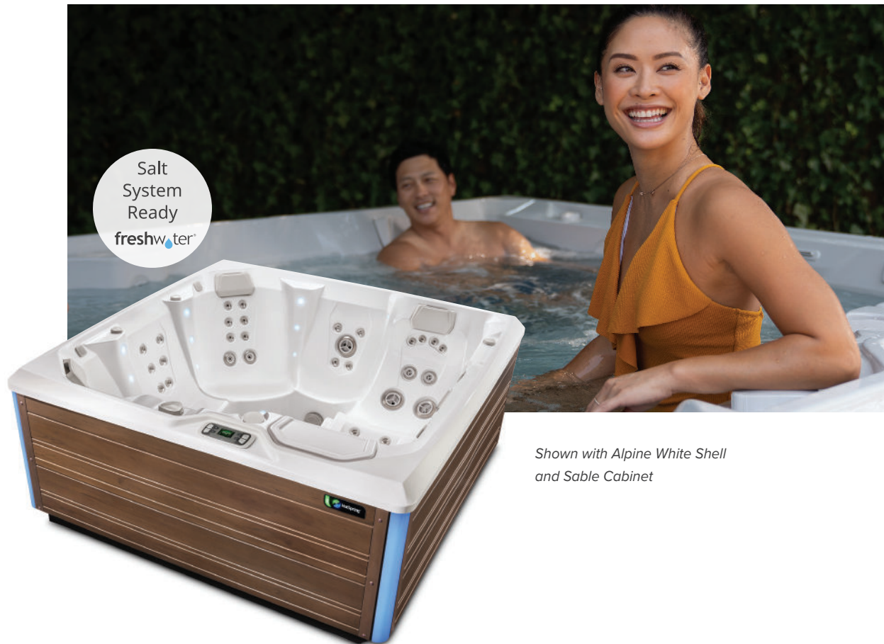
Shown with Alpine White Shell and Sable Cabinet