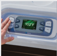
Color LCD Display