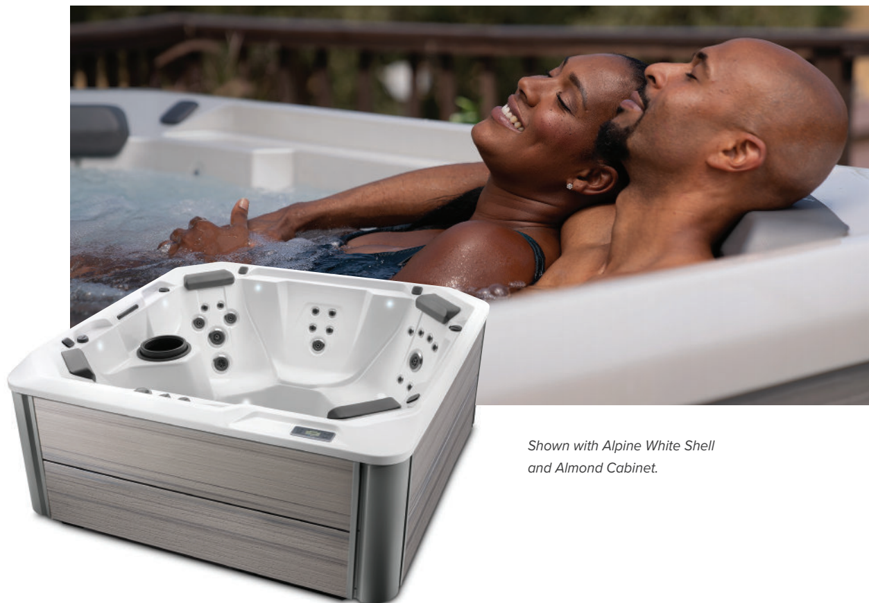
Shown with Alpine White Shell and Almond Cabinet.

People Seating Jets Voltage 7 Seats Open 40 Jets 230 V