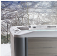
FiberCor® High-Density Insulation