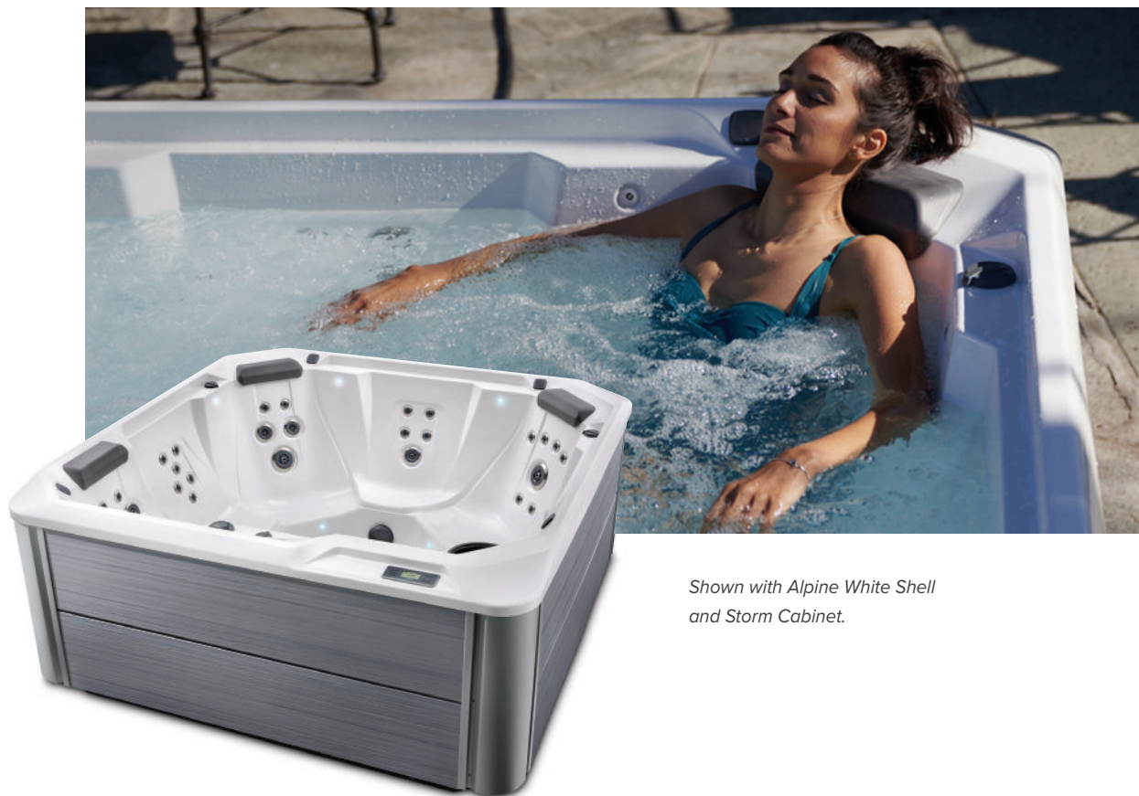
Shown with Alpine White Shell and Storm Cabinet.