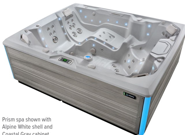
Prism spa shown with Alpine White shell and Coastal Gray cabinet.