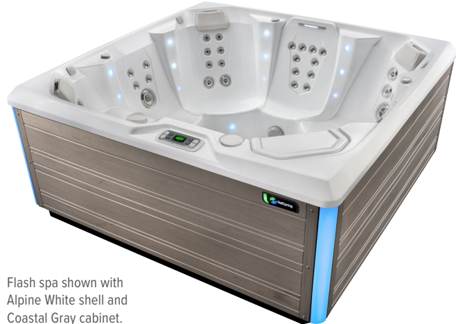
Flash spa shown with Alpine White shell and Coastal Gray cabinet.