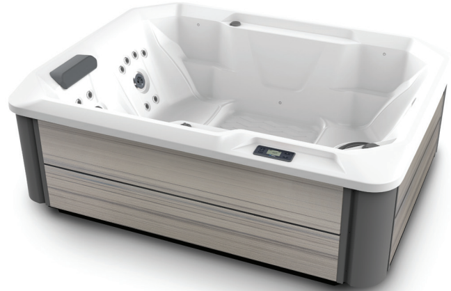
Stride spa shown with Alpine White shell and Almond cabinet.