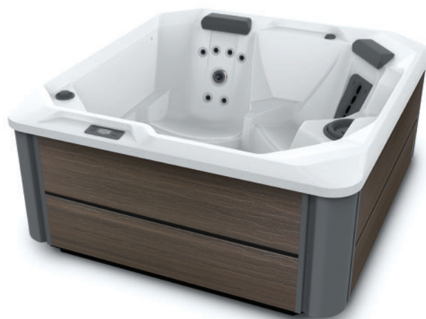
SX spa shown with Pearl shell and Havana cabinet.